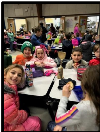
Golden Spatula Award Grade 1